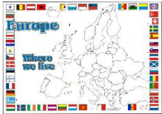
Write-on / wipe off blank map of Europe